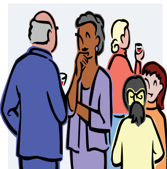
Remember! $5 renewal for members