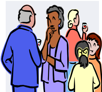
Remember! $5 renewal for members